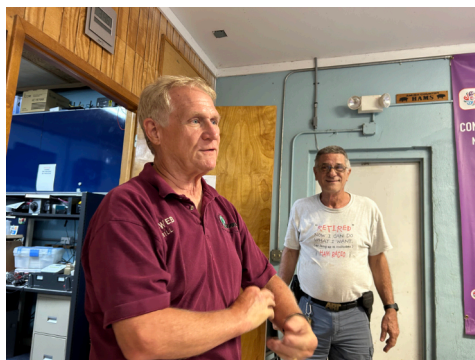
Tampa Amateur Radio Club