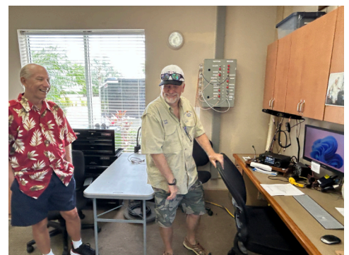
Kings Point Amateur Radio Club