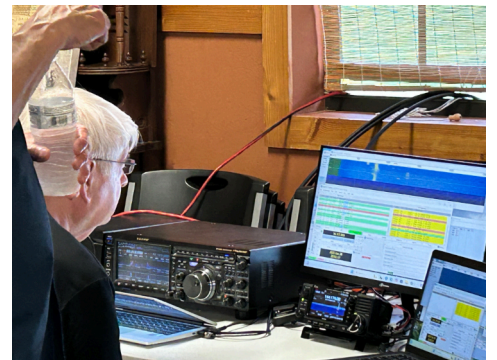
Lakeland Amateur Radio Club