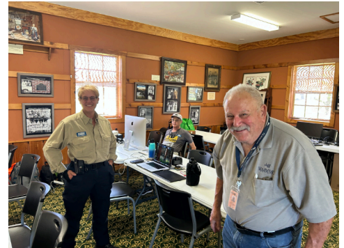
Lakeland Amateur Radio Club