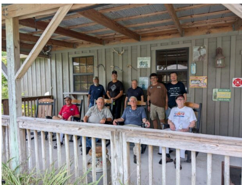
Lakeland Amateur Radio Club