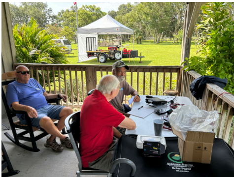
Lakeland Amateur Radio Club