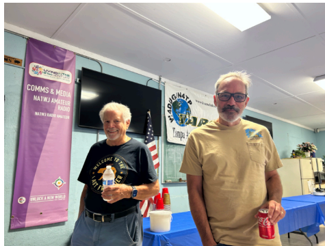
Tampa Amateur Radio Club