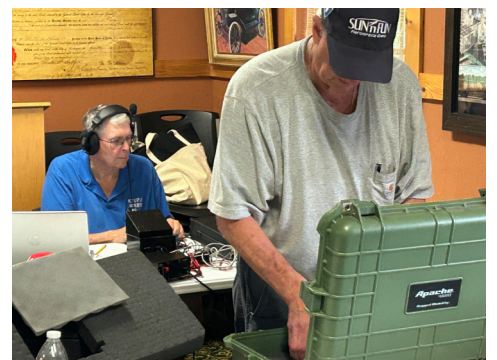
Lakeland Amateur Radio Club