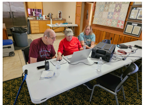
Lakeland Amateur Radio Club