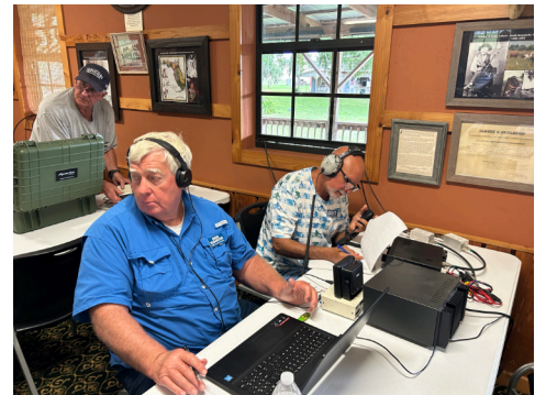
Lakeland Amateur Radio Club