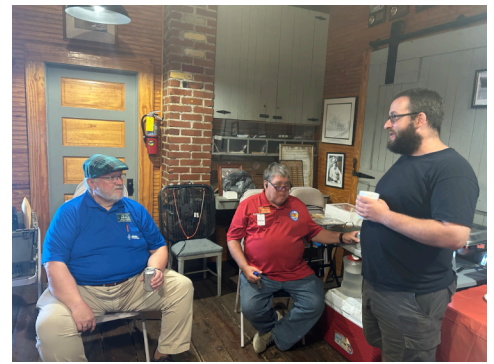
East Pasco Amateur Radio Society

Here are some of the photos from the three ARRL WCF Field Day Caravans that took place during Field Day 2025.