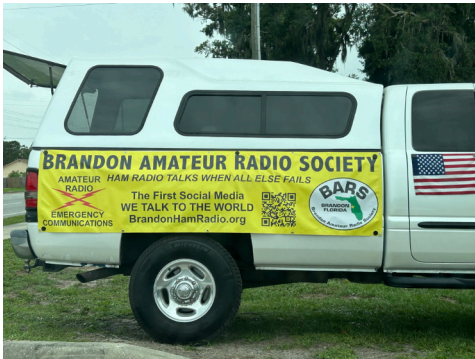
Brandon Amateur Radio Society