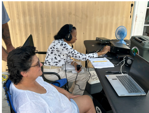
Brandon Amateur Radio Society