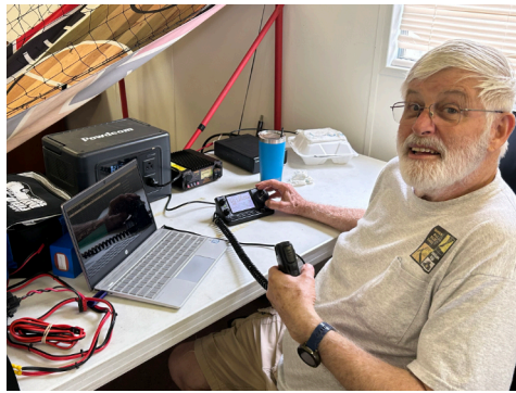
Brandon Amateur Radio Society