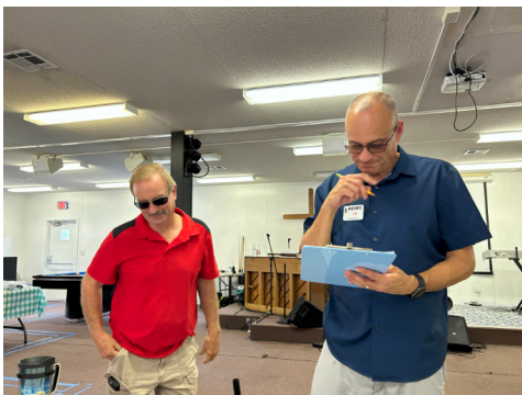
Brandon Amateur Radio Society