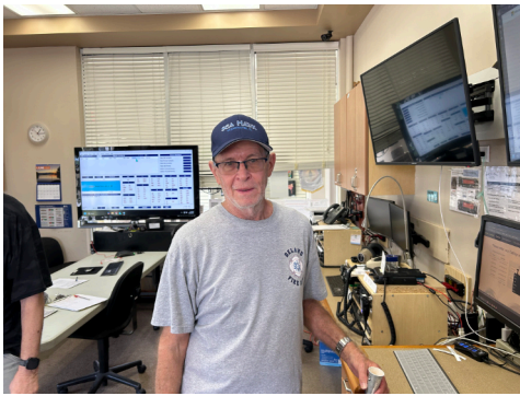
Kings Point Amateur Radio Club