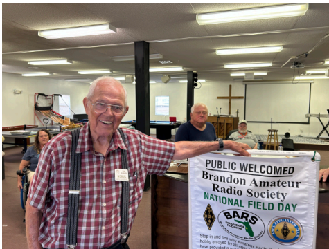
Brandon Amateur Radio Society