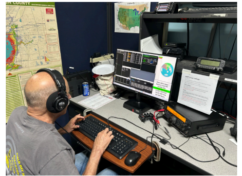
Tampa Amateur Radio Club