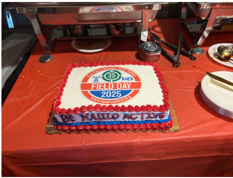
East Pasco Amateur Radio Society